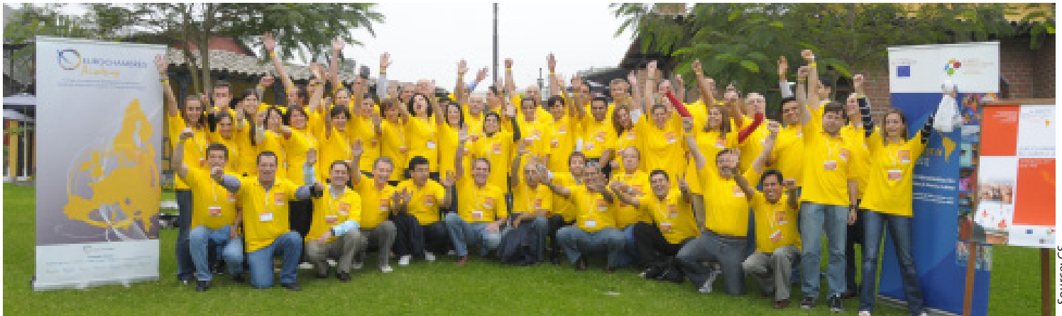
Attendants to the Latin American Academy.

For three days, the Peruvian capital became the stage of the fifth edition of the Latin American Academy, an important business meeting organized under the direction of EUROCHAMBRES, leader of the Coordination and Services Consortium in the AL-INVEST IV Program. The event brought together representatives from Latin American and European business areas. It was a key meeting point between Latin American and European business organizations.