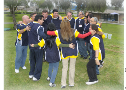
Attendants to the Latin American Academy.

“It has been a very different experience to be behind the ‘counter’ in the Academy, organizing and managing down to the details so that attendants feel well treated and carefree since their arrival. Thanks to EUROCHAMBRES’ extensive know-how in this type of events, it has been easier to organize and follow up on activities. I consider it a great opportunity to receive training on specific issues to manage the Chambers of Commerce and industrial institutions in this event, since this type of courses is not usually available on the market”.