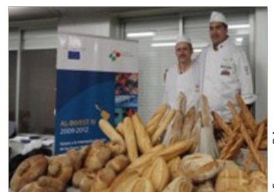
Colombian Businesspeople in the Intersicop Fair

Contact: Sergio Mendoza Sergio.mendoza@camaradirecta.com