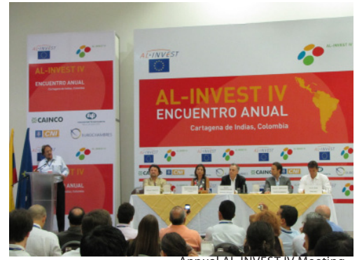
Annual AL-INVEST IV Meeting

AL INVEST IV INFORMS will publish shortly a special issue on the details of the event, which is an opportunity for communication between partners, intermediary bodies and institutions.